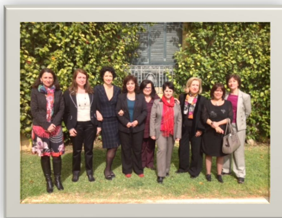
FFEM Founding Members

- Member of UNDP and Foundation for the Future think tank to support policy dialogue.