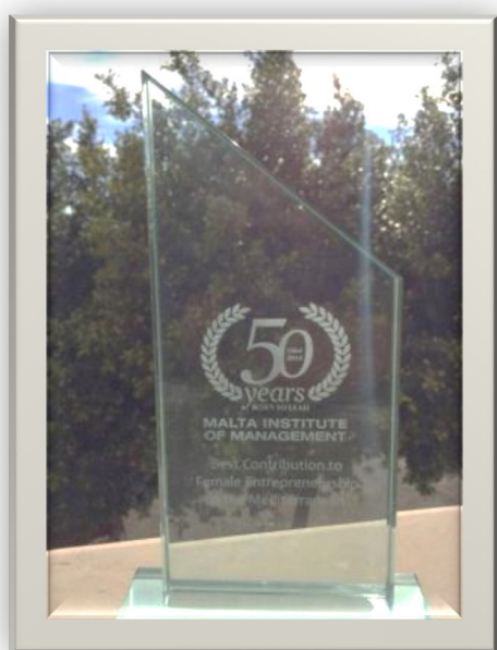
The Best Women Contribution Award

- Project on Decent Housing selected by UN-WOMEN as being among the innovative programs and solutions that empower women economically and in the public sphere . The project was presented during the South-South Development Expo in Doha, (Qatar, in February 2014), The Arab Regional Bureau /UNDP and the UN Office for South-South.